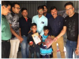
Books & Toys Distribution