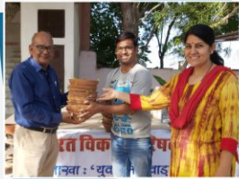
Bird Feeding Stand Distribution